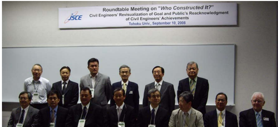
The panelists of the Meeting