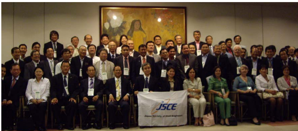
The participants of the International Program

The participants were Presidents of WFEO, JSCE, Korean Society of Civil Engineers (KSCE), National President of Philippine Institute of Civil Engineers (PICE) and delegates from Chinese Institute of Civil and Hydraulic Engineering (CICHE) and JSCE Chapters in Indonesia, Korea and Mongolia etc.