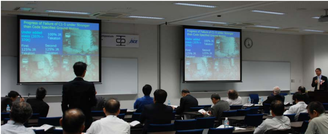
The participation situation of Symposium (a part of symposium hall)